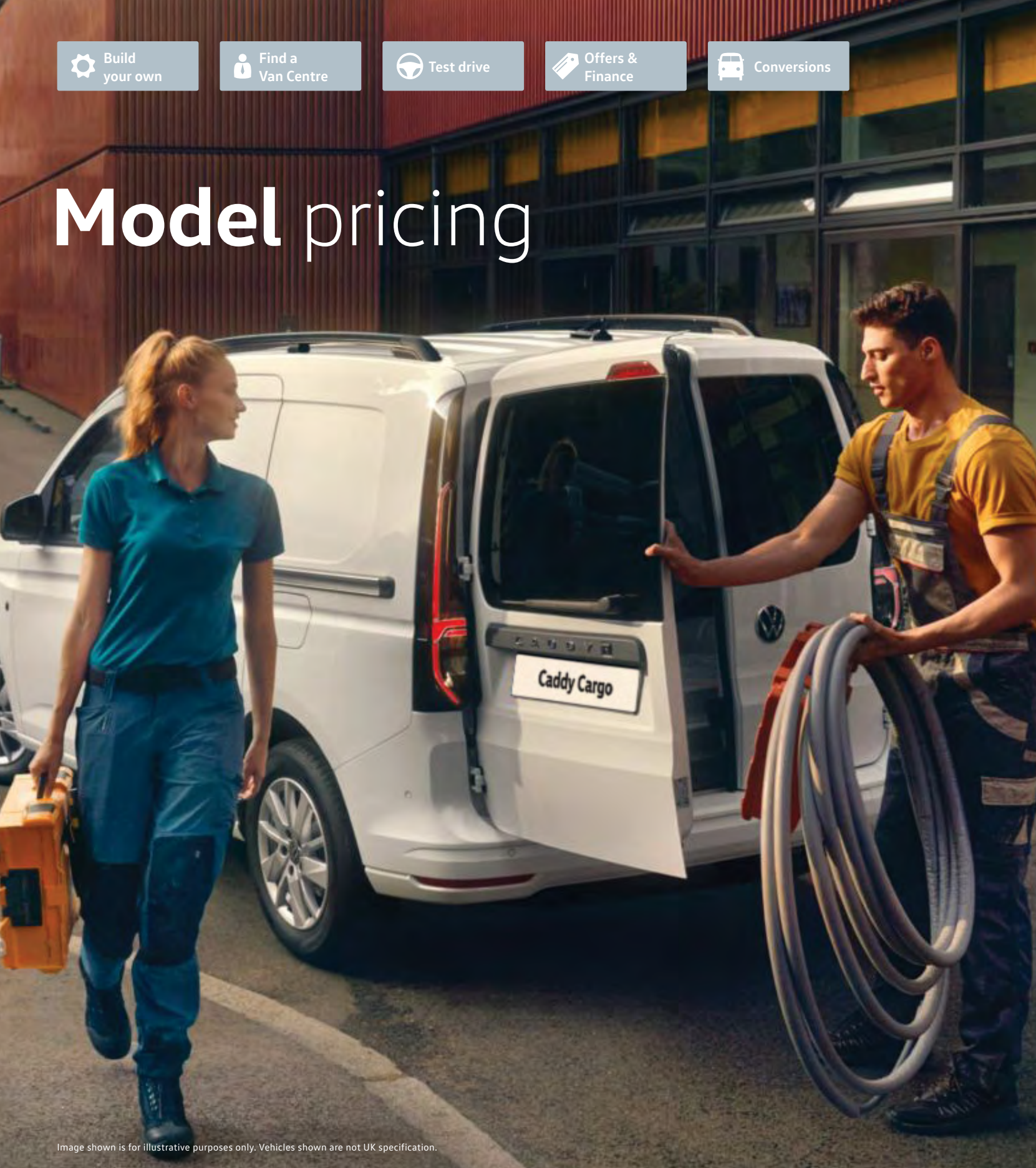
Image shown is for illustrative purposes only. Vehicles shown are not UK specification.